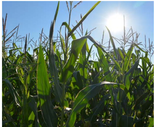
Field crops and forages are large agricultural crops in Osceola County.

During the past year in Osceola County, MSU Extension provided farm support and education through individual consultations, workshops, field tours, and research opportunities. Topics included grass-fed beef production, quality assurance, forages, multi-species cover crops, soil health, restricted use pesticide review, farm financial management, and farm stress. MSU Extension provided support for a number of beginning farmers, helping them to establish and grow their farming dream.