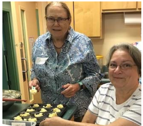
Dining with Diabetes is enjoyed by these participants.

Chronic diseases—such as diabetes—can be difficult to manage. We offer disease management workshops that introduce participants to skills they can use to manage their health and lives. Disease management participants report improvements in breathing, depression, pain, stress, and sleeplessness. We also offer prevention workshops related to physical falls and diabetes.