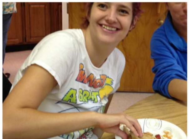
Kids learn to make healthy snacks during "Cooking Matters for Teens."

MSU Extension's Supplemental Nutrition Assistance Program provides basic nutrition education and hands-on activities for all ages. Core curricula are designed to help low-income families stretch their food dollars while maintaining good nutrition. Some instruction includes physical activity and cooking techniques that help instill life-long skills. It is estimated that every $1 spent on nutrition education saves as much as $10 in long-term health costs.